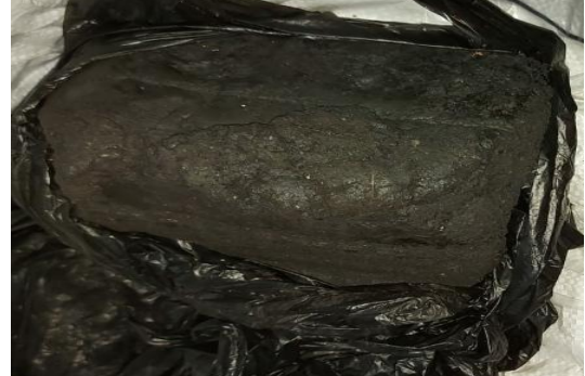
Figure 1.1: Mudgun Mass

Management/ Ministry replied (May 2021/ November 2021) that Centre for Engineering and Technology, SAIL was assigned study of capacity