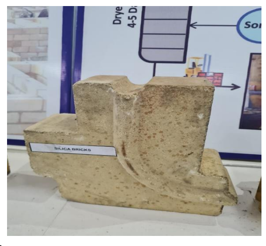
Figure 1.4: Silica bricks

Krosaki Refractories Limited) through limited tender considering these suppliers as only proven vendors. Three purchase orders for ₹7.73 crore were issued on M/s TRL Krosaki Refractories Limited during 2015-20. Audit noted that SAIL Refractory Unit was producing silica bricks and supplying the same to other SAIL plants. However, Bokaro Steel Plant did not give adequate and timely intimation about the requirement of silica bricks to SAIL Refractory Unit and made procurement at higher price from private parties. The Plant requested (31 March 2014) SAIL Refractory Unit to supply 3,427