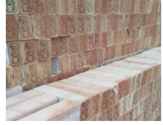
Figure 1.5: Steel Ladle Refractory

Management/ Ministry replied (May 2021/ November 2021) that average life of SAIL