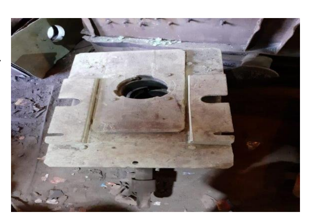
Figure 1.7: New Generation Slide Gate System

The ladle slide gate refractory system is a critical piece of flow control equipment in liquid steel casting. The basic function of ladle slide gate system is to control the flow of liquid steel from ladle to the tundish<sup>17</sup>. Till 2009, Steel Melting Shop-2 of Bhilai Steel Plant had been using conventional type of slide gate system i.e., FLOCON 6300. A new generation slide gate system was introduced in 2009 with the advantages of multiple heats, reliability and substantial cost reduction per heat over the conventional system. In view of the