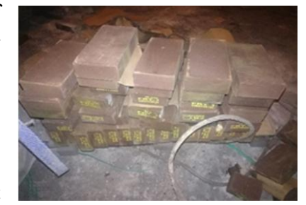
Figure 1.3: Fireclay Bricks

for ₹0.87 crore and ₹0.16 crore for capital repair of Coke Oven Batteries 1 to 5 and relining of Coke Dry Cooling Plant of Coke Oven Battery-6 respectively. Audit noted that out of the quantity of 1,66,000 pieces procured for Coke Oven Batteries 1 to 5, 1,19,981 pieces valuing ₹0.66 crore were not used. In case of Coke Oven Battery-6, material was not issued and lying in stores.